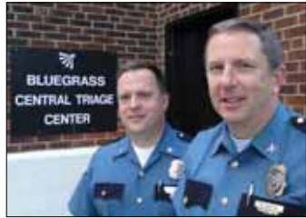
Stith Award Lexington Division of Police